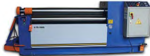
4-roll plate roll