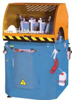
Aluminum upcut saw