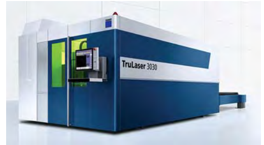
TruLaser 3060 Fiber