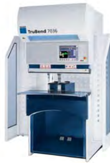
TruBend 7000 Series Servo electric drive