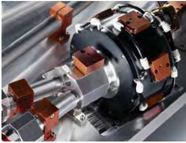
TruDisk Fiber technology up to 8000 watts Highest wattage available on market