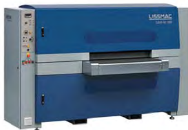
Lissmac edge rounding and oxide removal