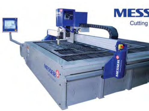
Edgemax - less space, max productivity