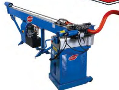
Rotary draw and mandrel bender