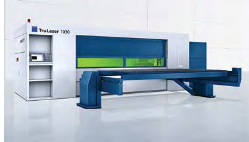
TruLaser 1030 Fiber