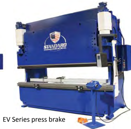
EV Series press brake

Made in the USA and backed by a 5 year warranty!