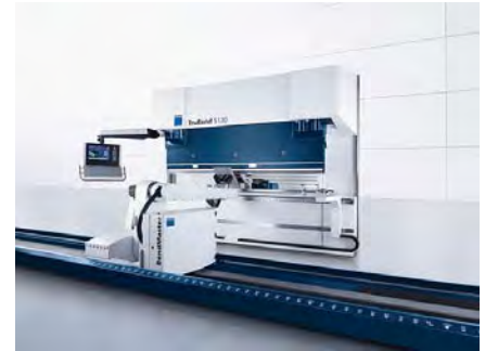
TruBend robotic bending cells