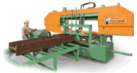
Structural band saws