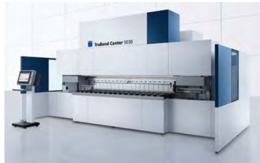
TruBend 5030 Panel Bender