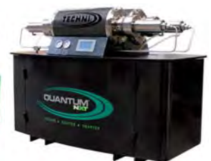
Quantum NXT electric servo pump