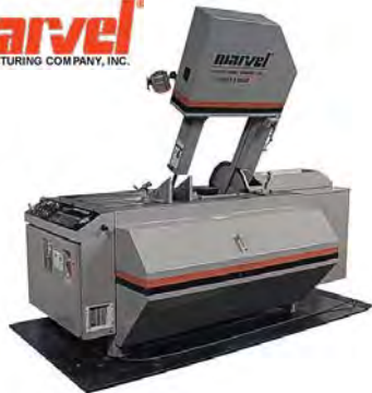
Manual and production vertical saws