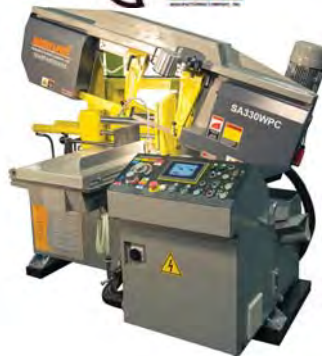
Production cutting band saws