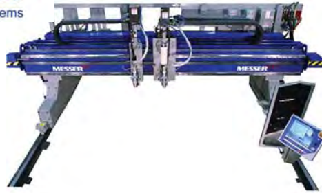
MPC2000 multi-process cutting