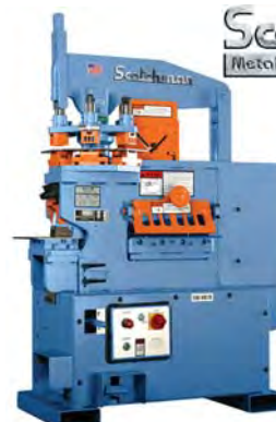
Ironworker with punch turret