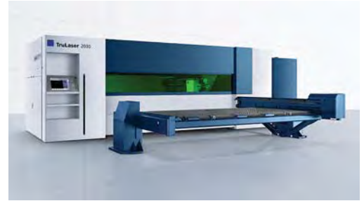
TruLaser 2030 Fiber