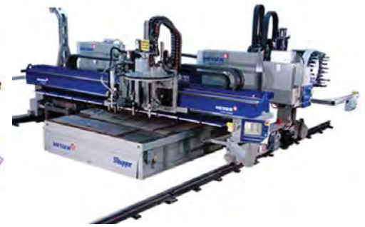
Messer Plasma Drill Bevel