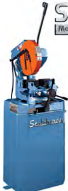
CPO350 cold saw