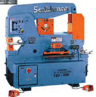
Dual operator ironworker