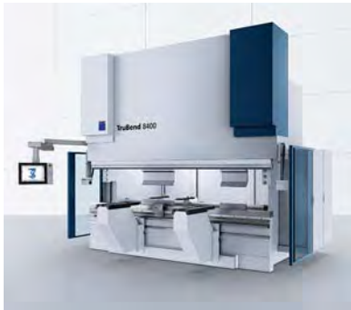
TruBend 8000 Press Brake