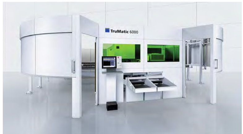
TruMatic 6000 Fiber punch laser combination

Choose electric, hydraulic, or punch-laser combination