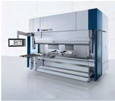
TruBend 5000 Series Servo/Hydraulic drive