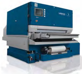
Steelmaster deburring and graining