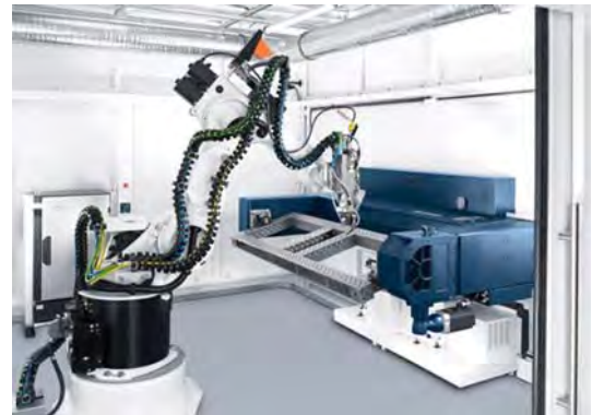
5020 laser welding cell