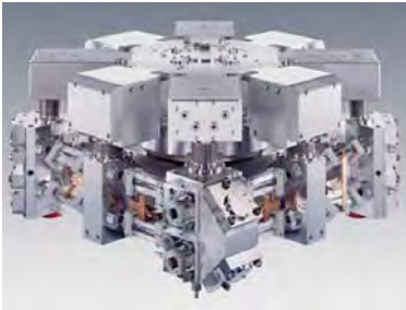
CO2 resonators up to 8000 watts Highest wattage available on market