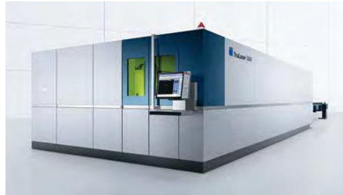
TruLaser 3030 Fiber or CO2