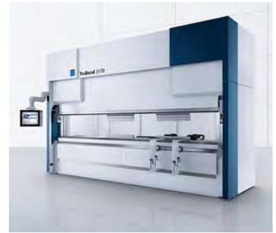
TruBend 3000 Series