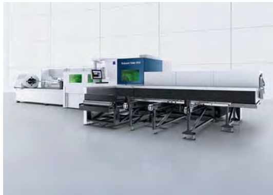
TruLaser Tube CO2 or Fiber