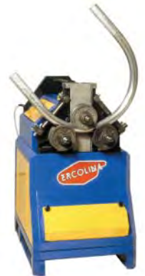
Angle & pipe roll