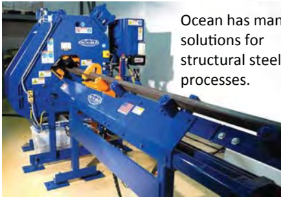
Ocean Clipper CNC angle line

Ocean has many solutions for structural steel processes.