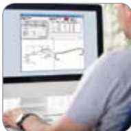
Easy Part Layout Software